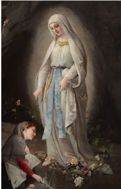
At the Sacred Spring Domenico Tojetti, 1877

Once the news begins to spread, there will surely be new sources of division within the local, and quite possibly broader Church, over the authenticity of such visions. People will question the motives and character of those on the other side, conspiracy theories arise, and little good will seem to come out of something that should be a source of great blessing and charity within the People of God. Alas, the poor bishop won't be able to win with his people, no matter which side he's on, as he undertakes the long and arduous task of examining the veracity of the event.