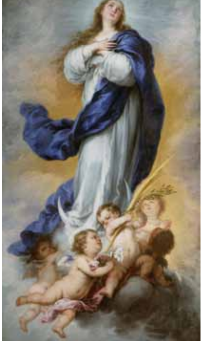
Inmaculada Concepción Bartoloméo Murillo circa 1675

Though he was in the form of God, Jesus did not deem equality with God something to be grasped. Rather, he emptied himself and took the form of a slave, being born in human likeness. He was known to be of human estate, and it was thus that he humbled himself, obediently accepting even death, death on a cross! Because of this, God highly exalted him and bestowed on him the name that is above every other name ... JESUS CHRIST IS LORD! (Cf. Phi 2:6-11)