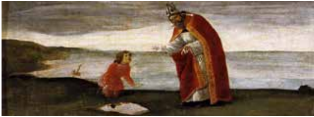
The Vision of St. Augustine from the Altarpiece of St. Barnabas, Sandro Botticelli