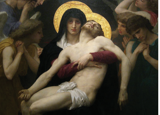
Pieta - William A. Bouguereau

and death. In great frustration, many of us cry out, "Why?!" St. Paul says, "The message of the cross is complete absurdity to those who are headed for ruin, but to us who are experiencing salvation, it is the power of God." (1 Cor 1:18) Thus, when we undergo this kind of suffering, the Lord is not afflicting us with suffering for its own sake; rather, through it he wills that we enter deeper into his divine love. Thus, we experience salvation by being purified and sanctified through the fire and power of God's love . Thus, even the Blessed Virgin Mary, who never